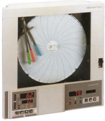
ABB Commander C1900 & E/RC 1900 Series Charts for Milk Processing and Canning Applications